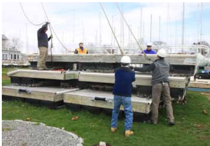
The team attaching the dock.

"Alone we can do so little; together we can do so much." – Helen Keller