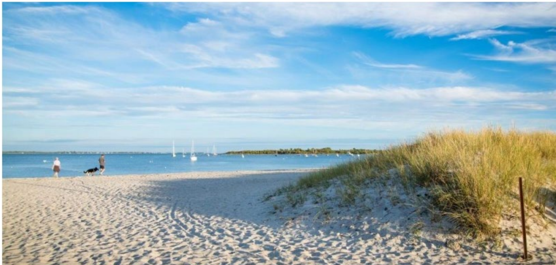
Third Beach, Newport.

DAY CAPTAINS: Stacy and EJ Dochoda “Skylark”