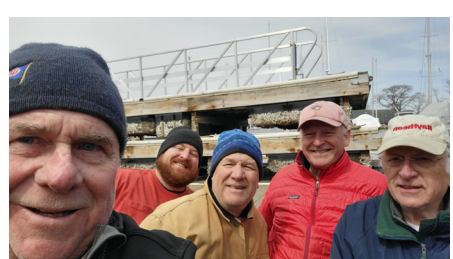
C'mon, join your friends to help get the Club ready. Who wouldn't want to have fun and work with these guys?

Join veteran and new volunteers for a fun day to get our Waterfront ready for the season. Upon sign-up, details will be provided to you.