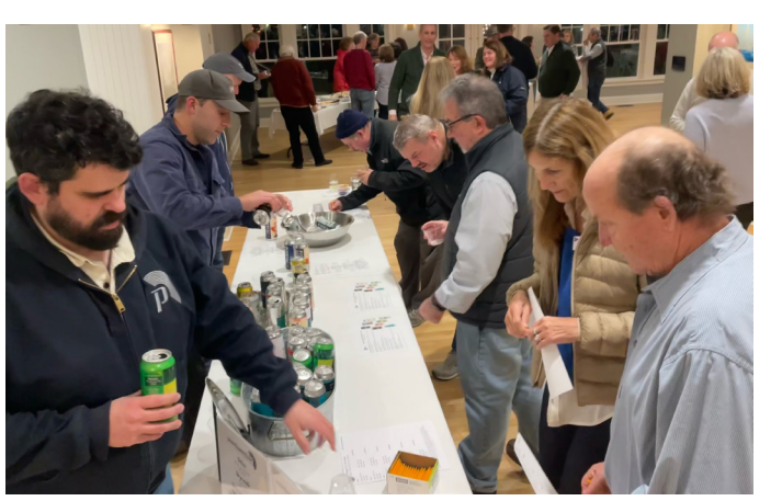
15 Beers from 8 Local Breweries and Craft Collective were on offer.

February 9 February 23 March 1 March 22 April 12 April 26