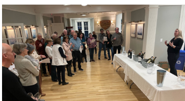
Everyone attending was provided with a brief overview of the wines on offer prior to tasting.